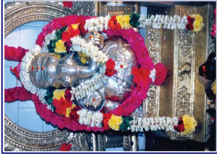
Lord Jaya Vinayagar